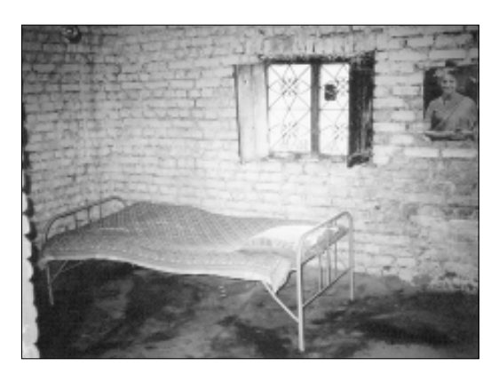
Staff housing in training centre for village evangelists