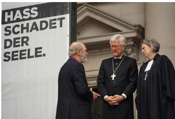
In discussion with the Presiding Bishop of the Protestant Churches in Germany and the Bishop for ecumenical Relations in front of the Berlin Cathedral

Unfortunately it's not possible to call a spade a spade, as to where bishops are prohibited by the police to welcome converts from Islam to Christianity in their