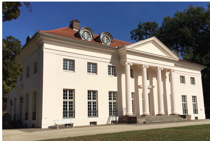
The Schönburg Palace, venue of the conference