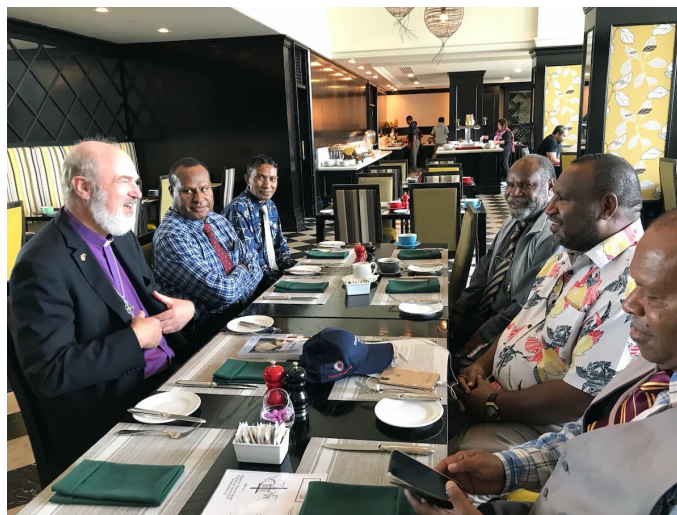
Working breakfast of Thomas Schirmmacher with the Prime Minister of Papua New Guinea James Marape (2nd from right) and the board of the Evangelical Alliance of Papua New Guinea

Nominally, 96 percent of the 6.8 million inhabitants are Christian, although many elements of the indigenous religions are still in practice. Due to the history of the mission, each of the approximately 1000 ethnic groups with 800 languages usually has a certain Christian denomination, with Catholics (20 percent), Lutherans (19.5 percent), Uniates (11.5 percent), Adventists (10 percent) and Pentecostals (8.5 percent) forming the largest denominations. Beside the