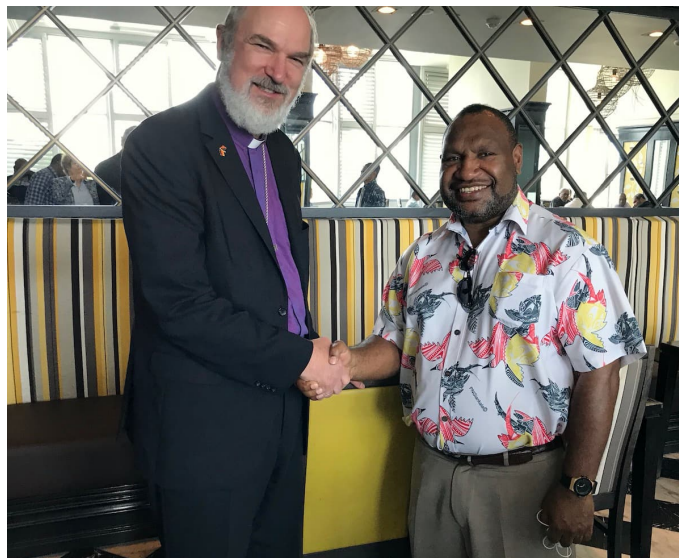
Thomas Schirmmacher with the Prime Minister of Papua New Guinea James Marape

(Bonn, 02.12.2019) After the President of the International Council of the International Society for Human Rights (ISHR), Thomas Schirmmacher, had pointed out to the German Bundestag the large number of ethnic groups threatened worldwide by the destruction of the rainforest belt of the earth, and highlighted the fact that the good protection laws in many countries are undermined by corruption on a large scale (BQ reported), the Prime Minister of Papua New Guinea, James Marape, invited him to get to know his new anti-corruption program. Schirmmacher, author of a book on “corruption”, promised the Prime Minister the support of a worldwide network of experts.