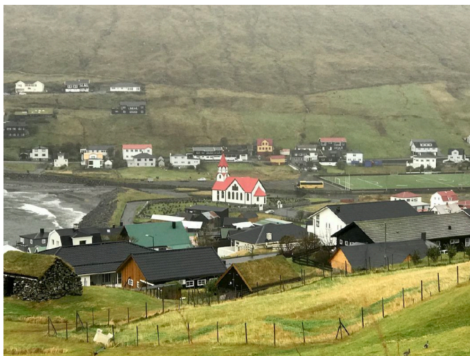
Sandavágur church in the valley

The adoption of Christianity in the Faroe Islands was a political matter, as in 999 Sigmundur Brestisson, one of two rival chieftains, sought support from the Norwegian King Harald Tryggvason, who himself had just become a Christian in 994. Brestisson won and ensured the adoption of Christianity by the Faroese Thing. In 1271 the Faroe Islands became a Norwegian colony and Christianity