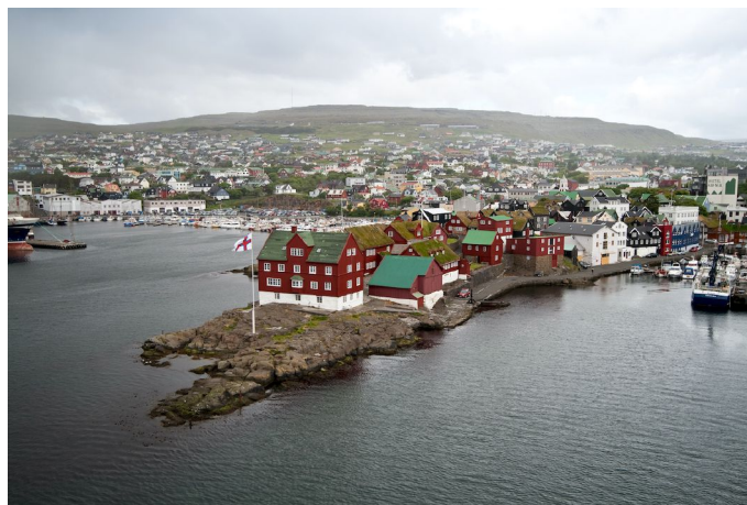
Tinganes, the headland with the government quarter at the place of the Thing since the year 825

No point on the Faroe Islands is further than five kilometres from the sea. Tórshavn is the smallest capital in the world. Government and parliament still reside in the restored wooden buildings from the 16th and 17th centuries on the headland of Tinganes by the sea above the harbour, where the Thing has been meeting since 825. Together with the Things on Iceland and the Isle of Man, these are the oldest parliamentary meeting places on earth.