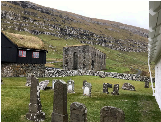
View from St. Olav's Church to the Magnus Cathedral

The centre of power, religion and culture in the Middle Ages was the bishop's seat in Kirkjubøer, about five kilometres south-west of Tórshavn, with the small St. Olav's Church from 1250 and the Vikings' Court from the 11th century. It was not until the end of the 13th century that the construction of the much larger Magnus Cathedral was started there, and probably never completed.