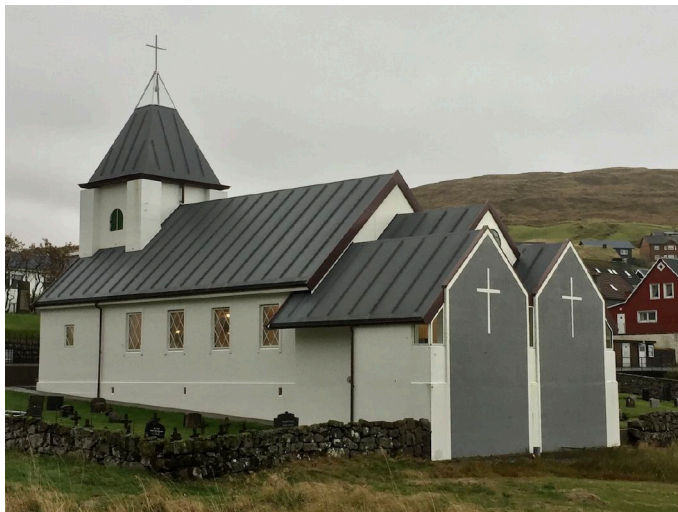
The Hósvíkar Kirkja