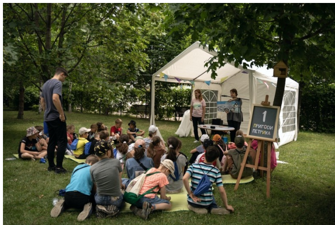
Children at the Ukrainian Children's Mission Camp follow an animal figure on an illustrated journey at Station 1