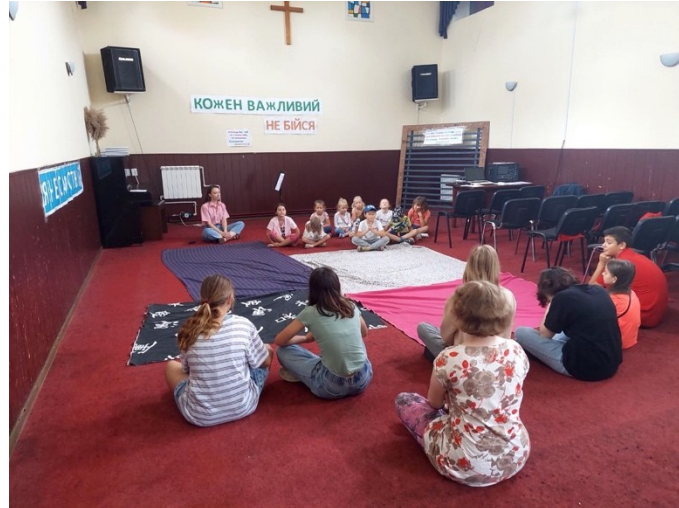
Children in the Ukrainian Children's Mission camps