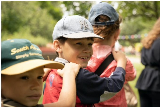
Children playing in the Ukrainian Children’s Mission Camp